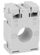
Current transformers DM0T0060